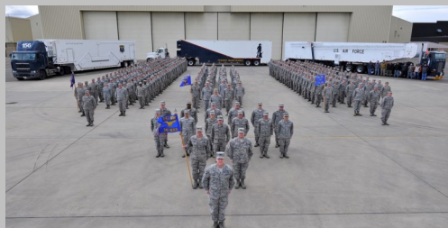
21Ms lead large maintenance organizations right from the start

Most organizations 21Ms lead are large, granting a lot of responsibility right away. 21M officers compete to command squadrons as a major, earlier than many other officers. 21Ms can command munitions, aircraft maintenance, and other squadrons, including munitions support squadrons in Europe. Many continue on to become maintenance group commanders.