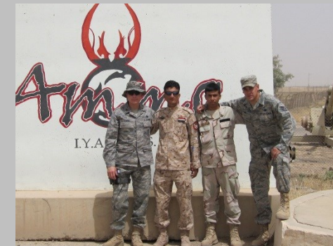
21M duties vary widely, from advising coalition partners on munitions expertise (above) to maintaining ICBM command and control systems in America’s interior (below) and much more.

21M assignments span the globe. There are munitions and missile maintenance positions in 26 states and territories, and 9 foreign countries, not counting the numerous special assignments 21Ms can fill beyond just the 21M career field.