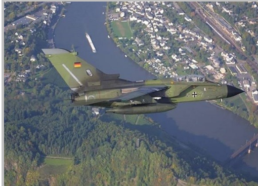
Munitions Support Squadron commanders serve as “mini wing commanders” working hand-in-hand with host-nation forces

CGOs develop expertise in at least two of three specialties: nuclear weapons maintenance, conventional ammunition, or ICBM maintenance. Positions include section and flight commanders, maintenance operations officers, instructors, and munitions accountability officers. There are multiple opportunities to compete for a broadening tour in other logistics career fields, such as aircraft maintenance, prior attaining field grade ranks.