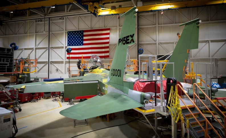
The Department of the Air Force awarded a nearly $1.2 billion contract for its first lot of eight F-15EX fighter aircraft, July 13, 2020.