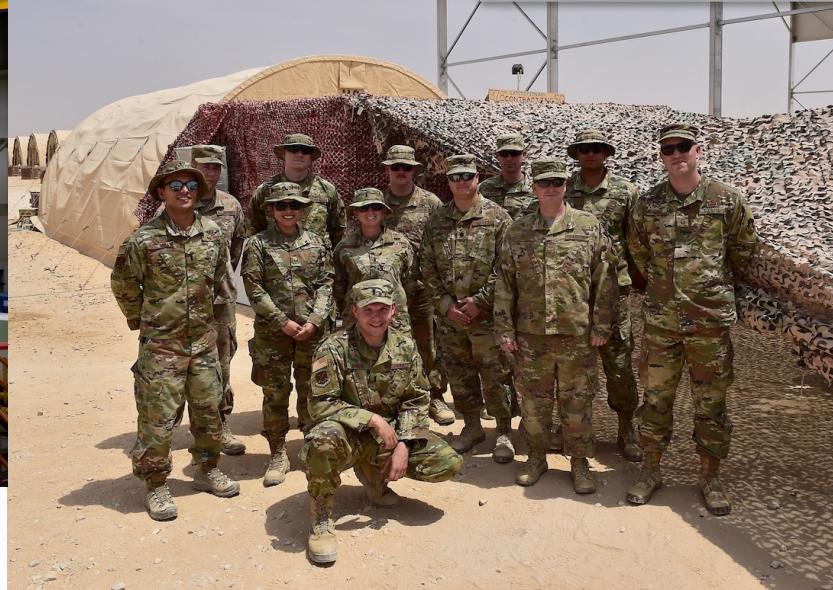
Airmen from the 378th Expeditionary Contracting Squadron provide support to Prince Sultan Air Base, Kingdom of Saudi Arabia. The 378th ECONS supports the warfighter, base operations, and host nation local business relations by securing equipment purchases and creating worker contracts for the base.